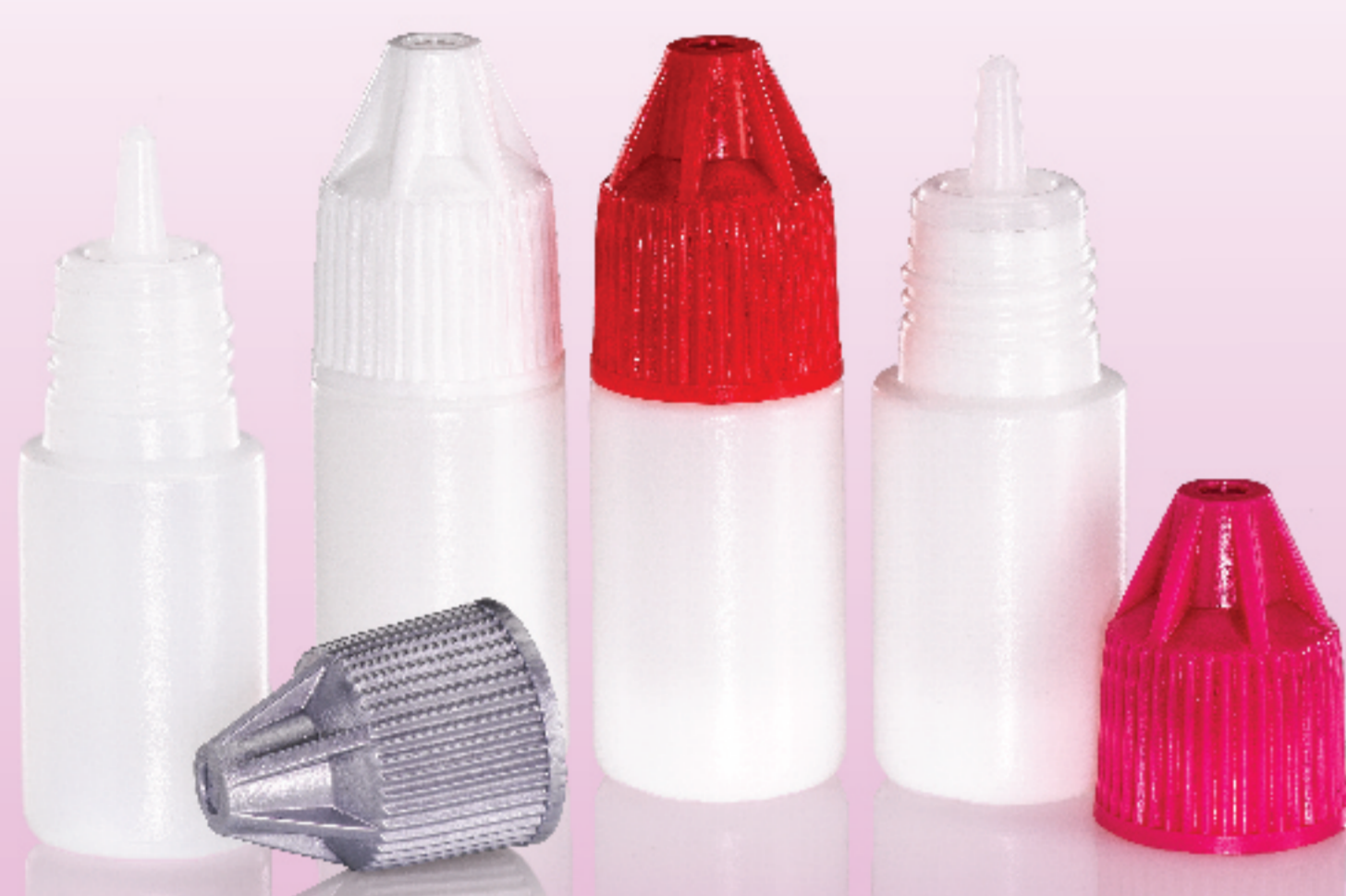
6 ml Round Mini

ThreeBond International has been a business-to-business leader serving the Nail Care Industry including retailers and independent salons. Our quality manufacturing of instant adhesives (cyanoacrylates), accelerators and removers have helped drive success for businesses across the nation. Specially filled and packaged in our facility in West Chester, Ohio, our products and array of bottle choices enable you to present your own private label and further build your brand.