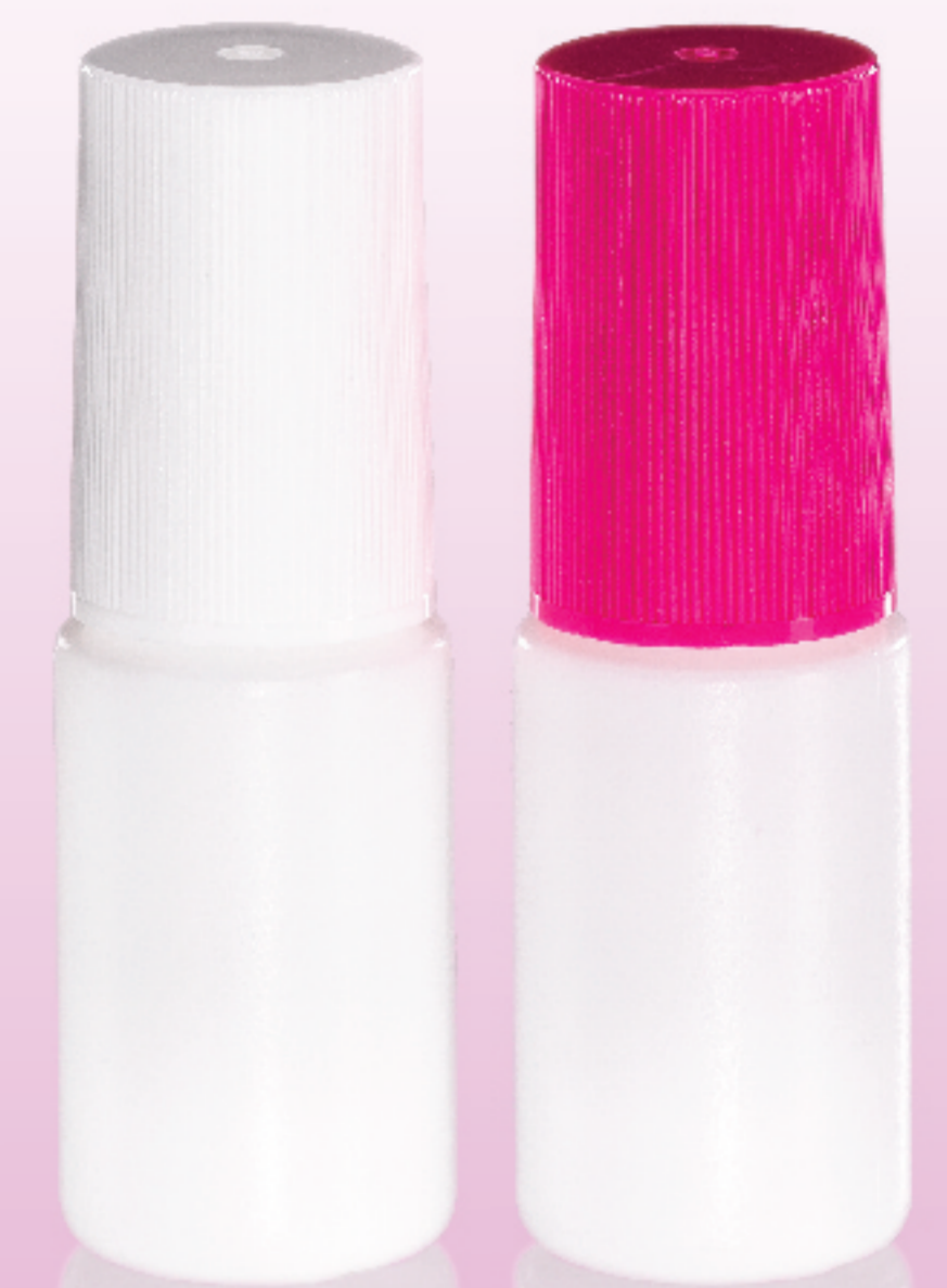
6 ml Round Mini