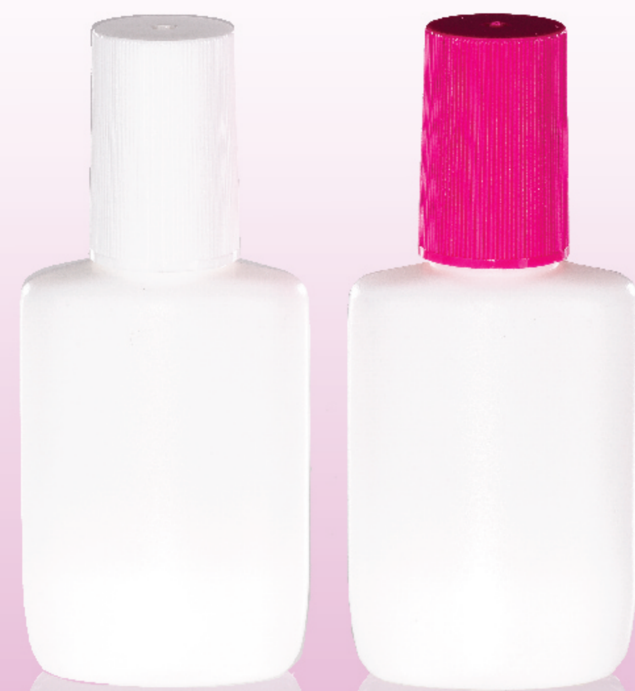
15 ml Oval