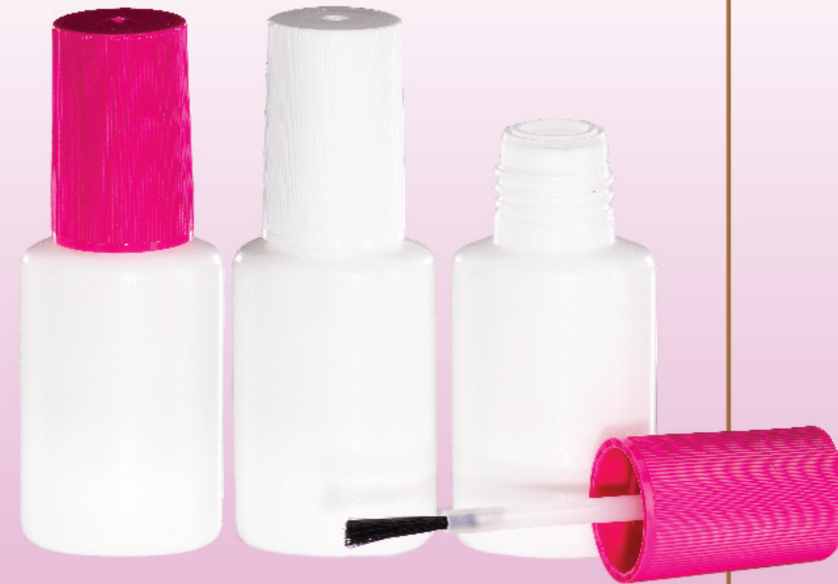
6 ml Oval